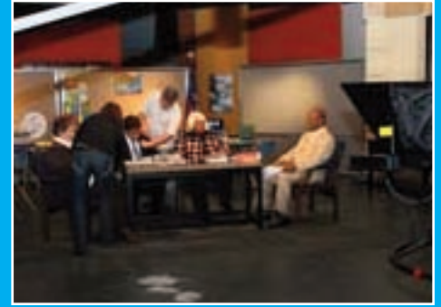
The KLCS staff readies the set for The Parent Connection , which is televised monthly.

in district-wide services. Funding is particularly important to parents because more than $500 million will be given to local schools to oversee and allocate. “Moving resources and decisions to the schools is in the best interest of our students,” said Superintendent Cortines. Budget plans are also at lausd.net , link to Budget Solutions. ●