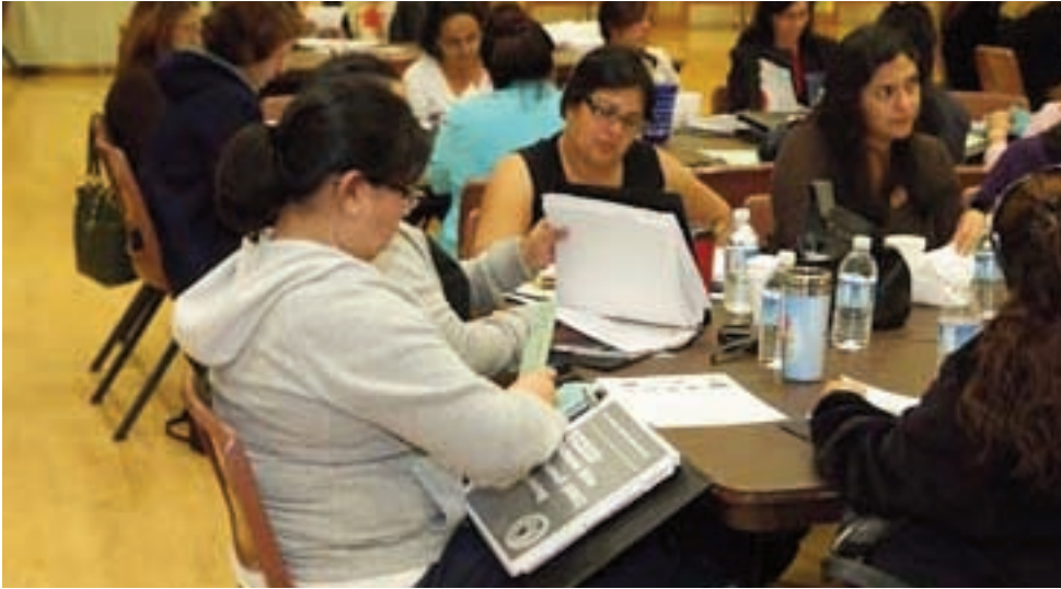
As more decision-making moves to local schools, the stakeholders elected for that responsibility such as these in Southgate study intensely for that role.

A s part of an effort throughout LAUSD to move school governance closer to local campuses, more than 5000 men and women—about one third were parents—attended training this fall to learn the rules and skills of school decision-making.