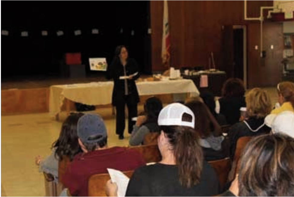
Their questions ranged from concerns about prepackaged food to tastiness as Lanai parents discussed school cafeteria issues with representatives of the district's Food Services Division.

The people responsible for feeding your children at school want to talk to you: about the choices in the cafeteria, about how to serve fresh fruit, about the time available for students to eat, dozens of aspects that make up the huge challenge of serving more than 120 million meals a year to LAUSD students.